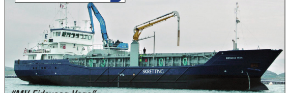
"MV Eidsvaag Vega", Feed vessel for the fish farming industry (fish feed transport, salmon fish feed)