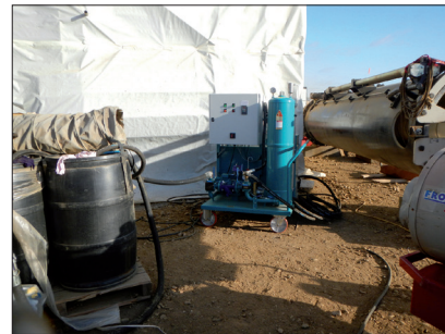
CJC™ MFU processing oil during shovel assembly. At right is the massive crowd cylinder