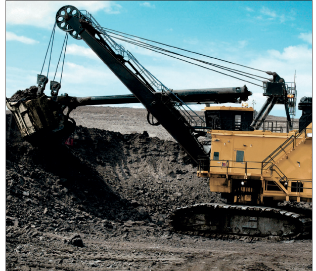
This mining shovel is one of the largest in the world

Including filling, filtration, and transferring to the shovel, the overall oil processing time was reduced from nearly 1 week to roughly 1 hour per batch!