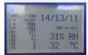
ISO Code after installation of the CJC™ MFU