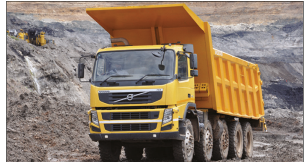
Volvo Mining truck with CJC™ Oil Filter installed, operating at Chirano Gold Mine, Ghana - an underground and open pit gold mine