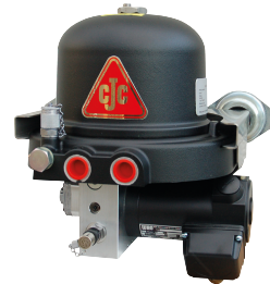
CJC™ Heavy Duty HD HDU 15/12 oil filter